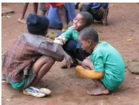
Young Swazi boys engrossed in their traditional game of skill and tactics at the Nwandle children's home located on the outskirts of Manzini