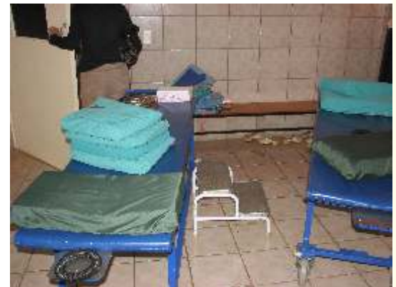
<<The microscope and instruments located between the two specially adapted and locally made operating theater beds is able to quickly move from one patient to the other. These special beds seen (above) in the prep room, help speed up the movement of patients in and out of theatre.