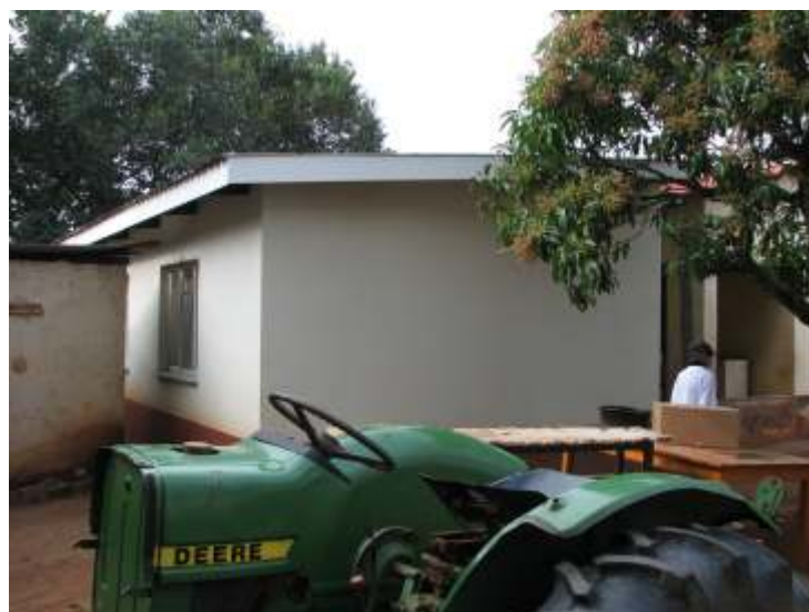
The Manzini Lions Club recently completed a new dormitory for the "Nwandle" children's home - one of many serving the Manzini area.